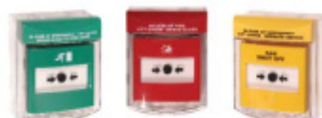
STI Call Point Stopper Colours Available