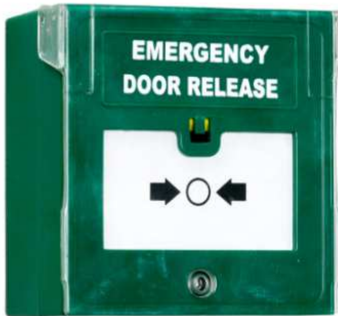
Emergency Door Release