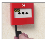
Step 3: To reset a simple key is inserted into the bottom of the call point.