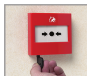
Step 4: A quick turn of the key and the call point is reset and ready for use again straight away.