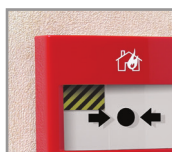
Step 2: A warning indicator drops into view when the call point is activated.