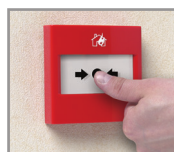
Step 1: Positive action - mimics the feel of breaking glass.

The reset uses a simple mechanism which consists of a rigid plastic operating element and an over centre spring mechanism. This arrangement provides real action on operation and simulates break glass activation. An activation indicator drops into view at the top of the window after the reset has been operated. The unit is then simply reset with a key and is ready for reuse straight away.