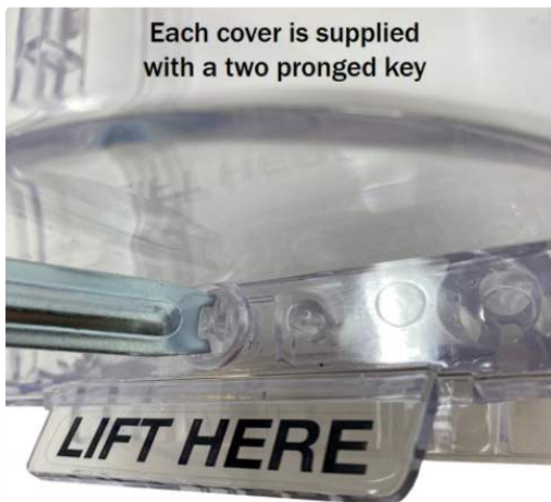
Each cover is supplied with a two pronged key

Simply turn key 90 degrees to open cover