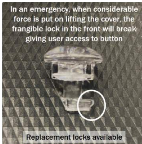
In an emergency, when considerable force is put on lifting the cover, the frangible lock in the front will break giving user access to button

Simply turn key 90 degrees to open cover