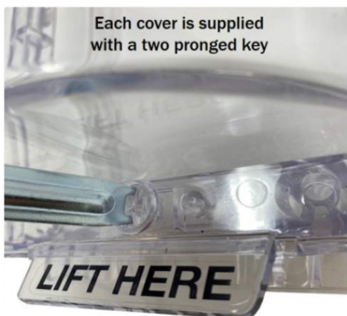
Each cover is supplied with a two pronged key

Simply turn key 90 degrees to open cover